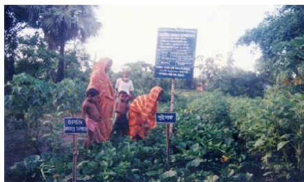
Plate 5 Women participation