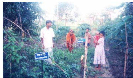
Plate 6. Rural youth involvement